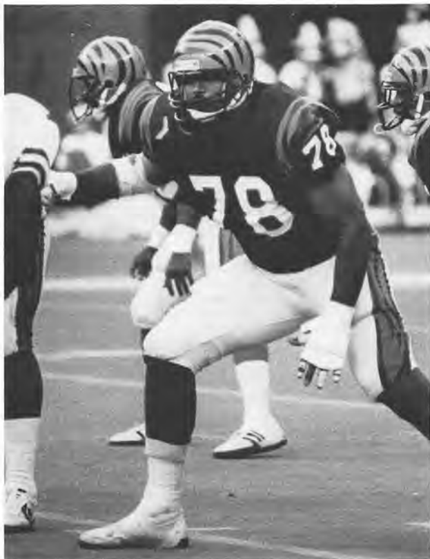
ALL-PRO OFFENSIVE TACKLE ANTHONY MUNOZ ... five consecutive Pro Bowl appearances.

*NBC-TV Doubleheader Week, **CBS-TV Doubleheader Week.