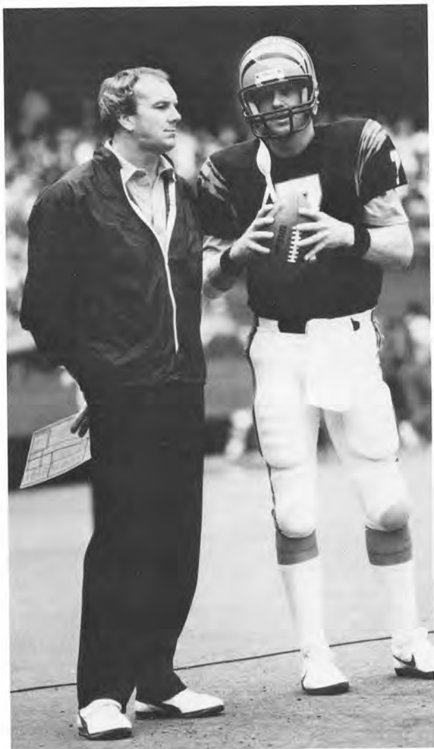
Sam Wyche and Boomer Esiason