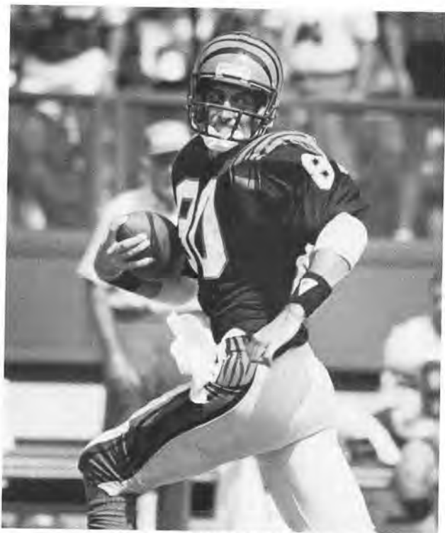
CRIS COLLINSWORTH IN 1985 ... 65 receptions, 1125 yards, five touchdowns.